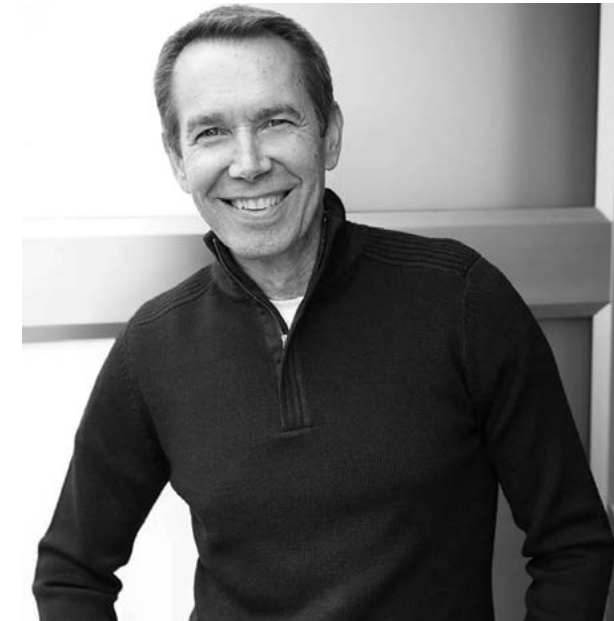
Jeff Koons — Artist in Residence.

Jeff Koons was born in York, Pennsylvania in 1955. He studied at the Maryland Institute College of Art in Baltimore and the School of the Art Institute of Chicago. He received a BFA from the Maryland Institute College of Art in 1976. Koons lives and works in New York City.